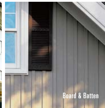
Board & Batten