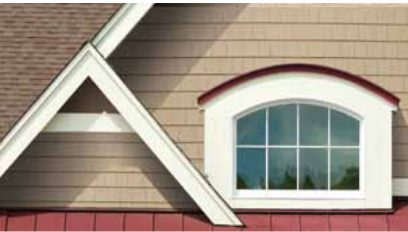
Single 7" Cedar Shakes